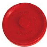
XGQT06 End Cap