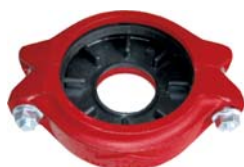
XGQT2Y Reducing Coupling