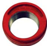
06P Cap with Eccentric Hole